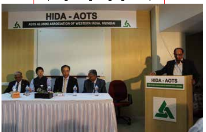
Consul General & Mitani san (Inaugurating Language class)