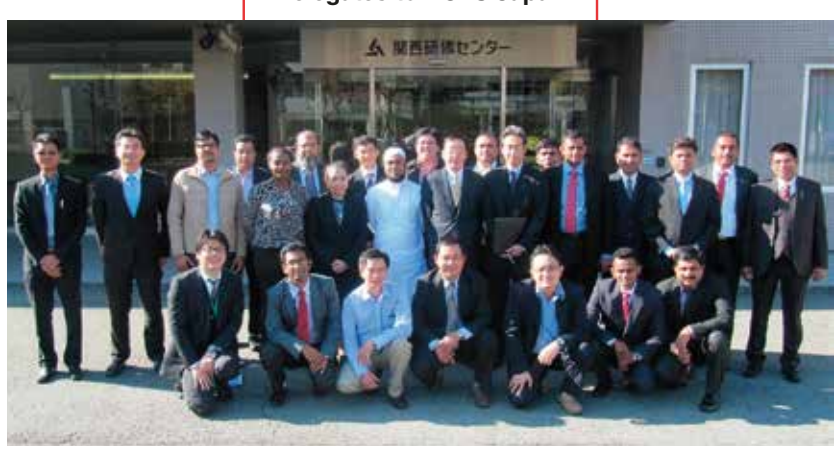
Delegates to AOTS Japan